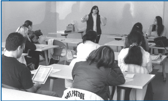
Parent Patrol volunteers receive training.