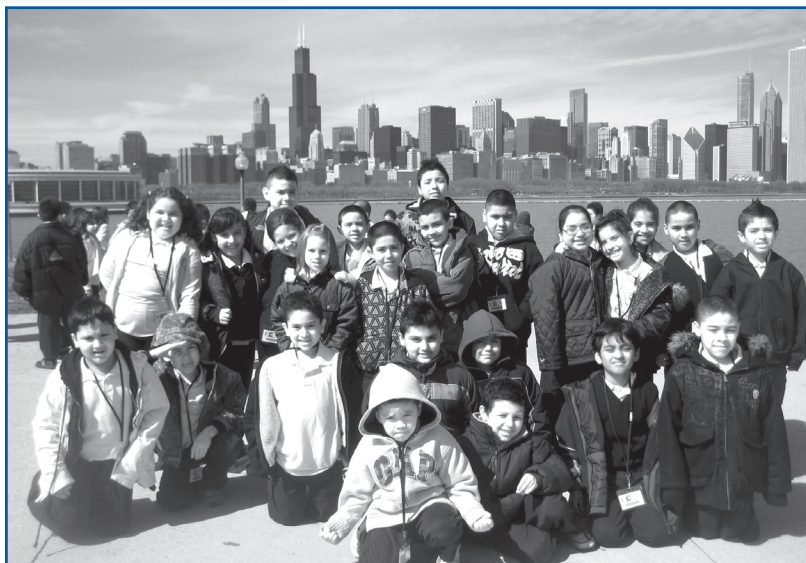
Sherlock third grade students' fund-raising efforts helped pay for their trip to the Adler Planetarium, Chicago. See article on page 4.

district also recycles items, including fluorescent bulbs, ballasts, computers, paper, aluminum, and plastic. The district is conserving energy and saving dollars during non-attendance hours by keeping lights off and temperatures lower. The custodians and maintenance staff are participating in training to learn all they ways they can help the schools be green. Be a Green Team player at home: reduce, recycle, reuse!