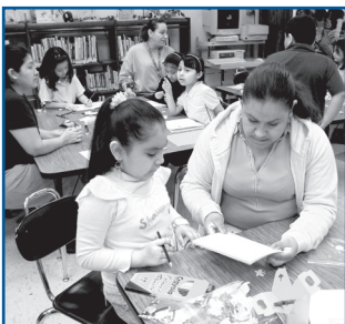
Participants in McKinley School's book publishing event.

Roosevelt School focused on strengthening the home-school connection. Family events included Hispanic Heritage Month in October, with cuisine and music from different countries; curriculum nights; a holiday presentation in December; and the school's first family dance in February. Families were invited to celebrate the completion of the school year with the annual Roosevelt Talent Show on May 18.