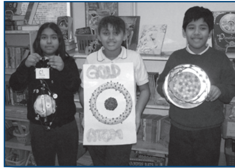
Several Columbus East students display their science projects.

Woodbine School celebrates the end of every quarter with popcorn and an attendance raffle. Students who have shown effort and are current on their school-work attend. Each week, students with perfect attendance receive an entry for a drawing that is held at the celebration. At the end of the year, students with perfect attendance can enter a drawing for big prizes.