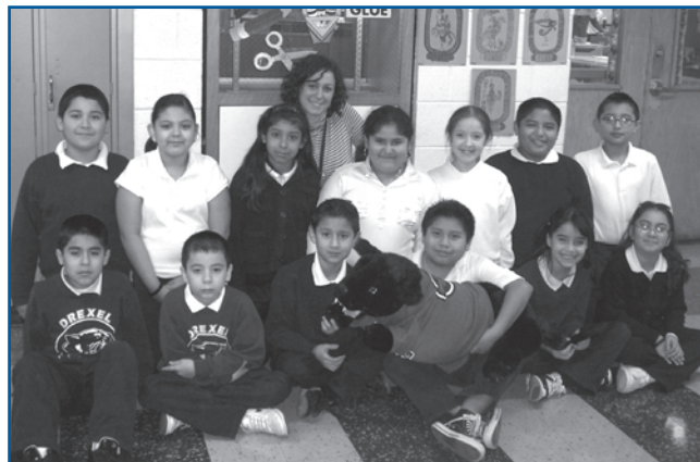
Drexel School students in room 307 won Drex, the school panther, for two weeks.

Drexel School classrooms can win the honor of keeping Drex, the school’s panther mascot (in stuffed animal form), for two weeks. Classrooms that win competitions such as having perfect attendance being the first to complete an important assignment,