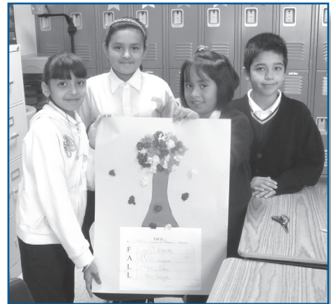
Columbus West students studied autumn through words, poems and a craft project.