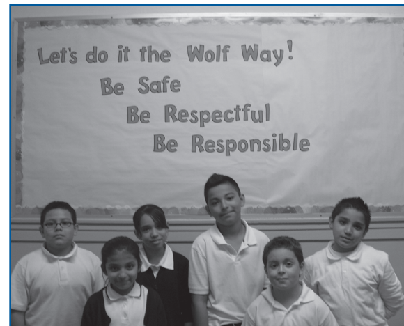
Cicero East students learn the rules of PBIS, a behavior program.